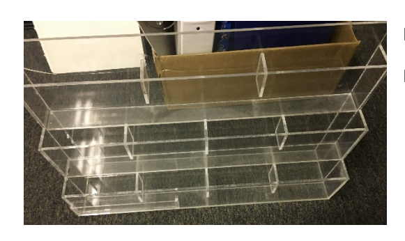
Plexiglass pamphlet rack and Metal picture frames